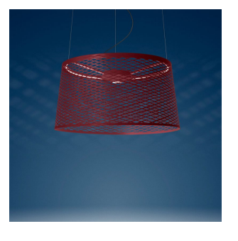
Twice as Twiggy Grid