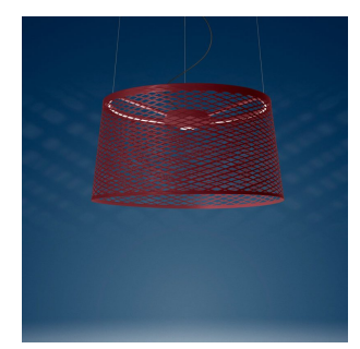
Twice as Twiggy Grid