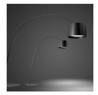
Twice as Twiggy