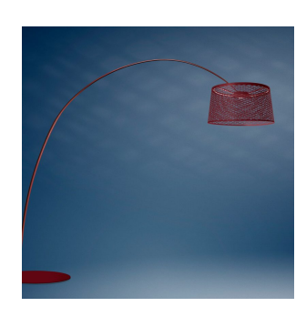
Twice as Twiggy Grid