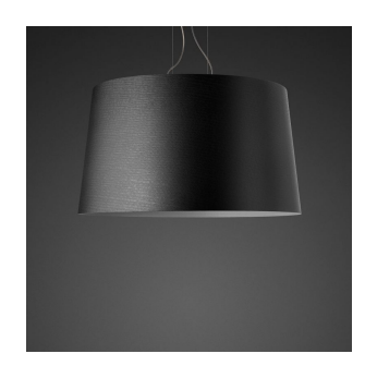
Twice as Twiggy