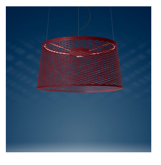
Twice as Twiggy Grid