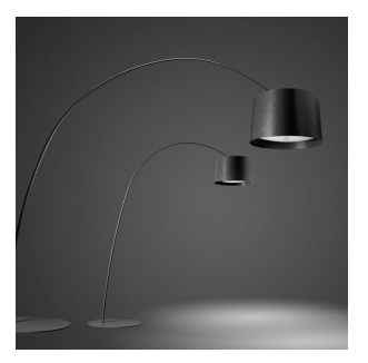
Twice as Twiggy