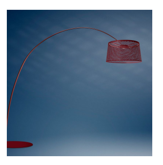
Twice as Twiggy Grid