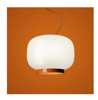
Chouchin Reverse 1