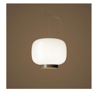
Chouchin Reverse 3