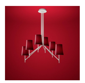
Birdie Birdie Birdie Birdie