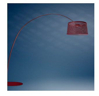
Twice as Twiggy Grid