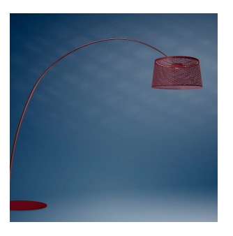
Twice as Twiggy Grid