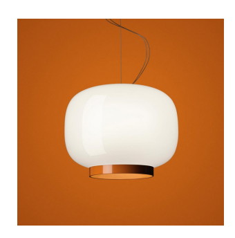
Chouchin Reverse 1