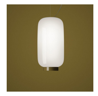
Chouchin Reverse 2